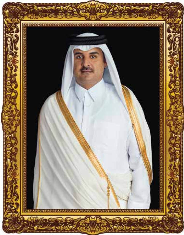
His Highness Sheikh Tamim Bin Hamad Al-Thani Emir of the State of Qatar